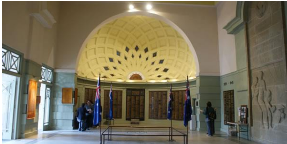
Geelong & District Fallen Roll of Honour