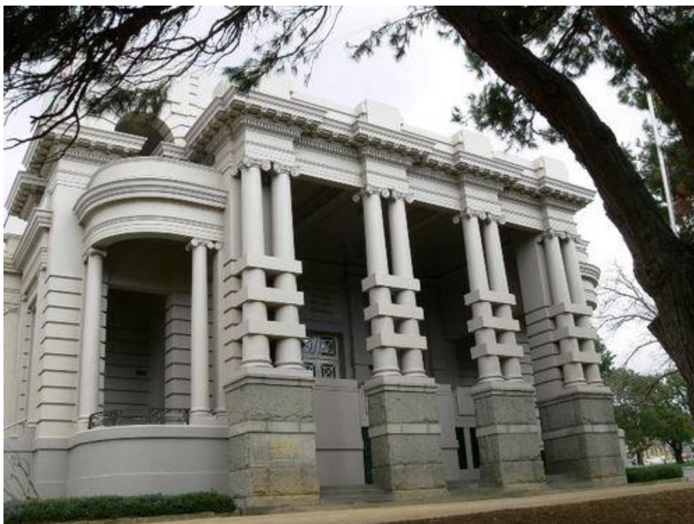
Geelong Peace Memorial