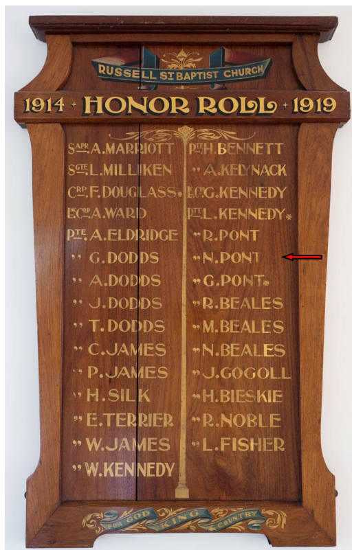
Russell Street Baptist Church Chilwell (Newtown) Honor Roll

N. Pont is remembered on the Russell Street Baptist Church Chilwell (Newtown) Honor Roll, located in One Hope Baptist Church, 4 – 32 Province Boulevard, Highton, Victoria.